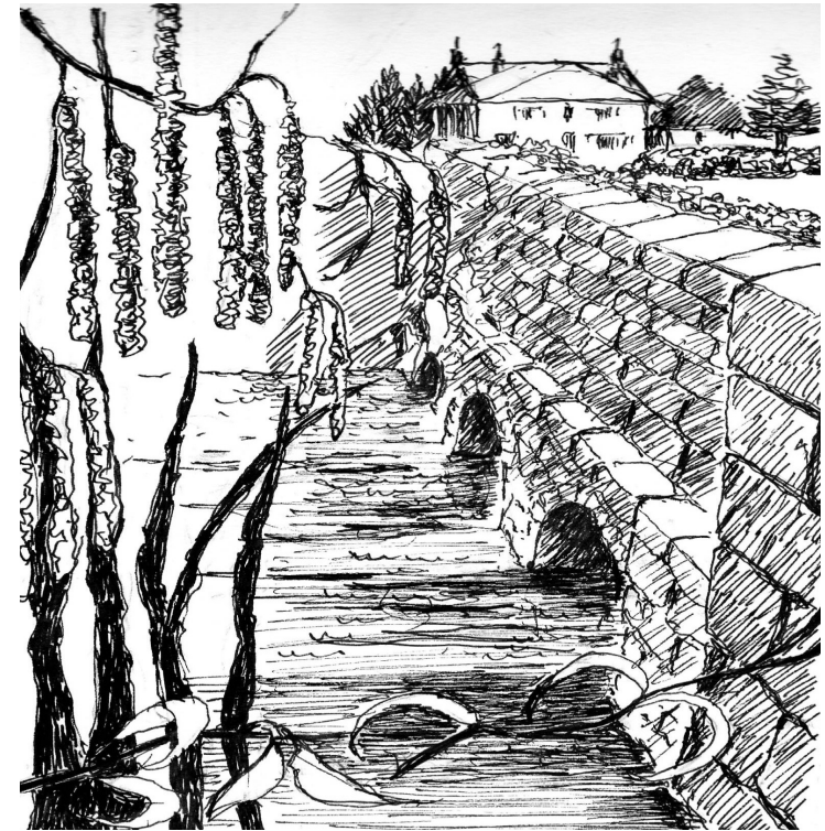
The bridge, Sand Street, Longbridge Deverill by Pat Armstrong